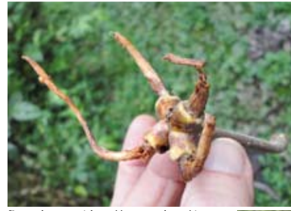
Cecropia cores stripped by aracarís and toucans.