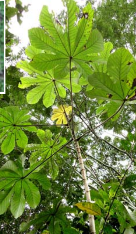
Cecropia tree →

This was my best of many photos, so I also used my bird book for reference.